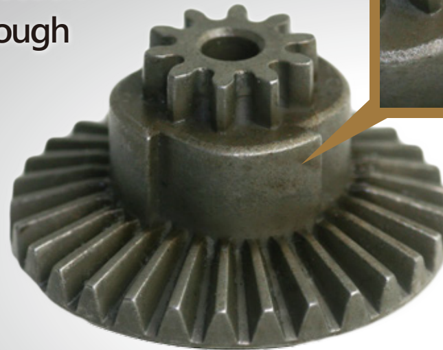
NO.1 GEAR MC-218

ICS No.1 gear and motor gear are all produced via MIM (Metal Injection Molding) process, broke through the limitation of tranditiona process, and re-design the angle and caliber of gear to maximize functionality and reduce revolving noise. They are the perfect gearbox upgrade choices.