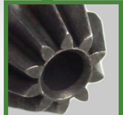
MOTOR GEAR MC-219