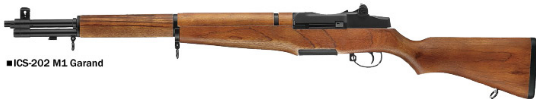
■ ICS-202 M1 Garand

A Legend that ICS shouldn't miss, The M1 Garand.