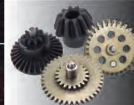
MIM (Metal Injection Molding) Pinion and Bevel Gears