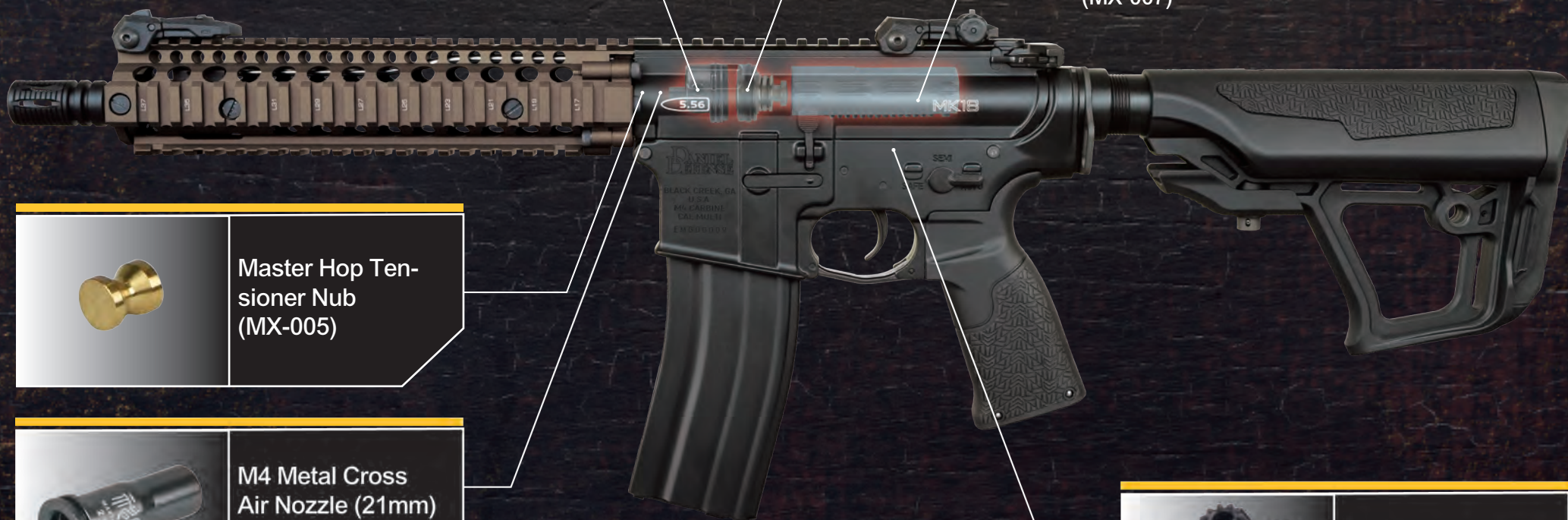
Full Steel Teeth Piston (MX-007)