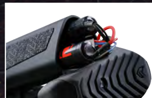
Enlarged battery compartment