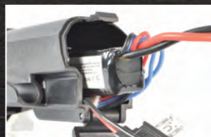
Enlarged battery compartment

The PDW stock adapts the metal adapter to ensure the maximum strength. The stock is made of top industrial polymer for lightweight and durability. Adjustable 3-position fast draw deployment stock. Enlarged battery compartment design stock tube, available for 3-cell Li-Po battery.