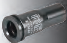
M4 Metal Cross Air Nozzle (21mm) (MX-004A)