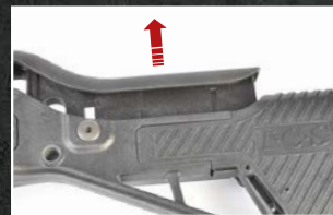
3-level cheek rest

The S.F.S Stock System is featured with a rapid adjustable 3-level cheek rest and a 4-length adjustable and foldable stock. The total length of the replica can be significantly reduced after folding the stock, ideal for using in narrow spaces.