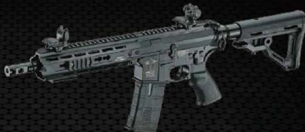
ICS-270 (Front Wired)