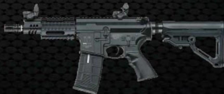
CXP-HOG COB MTR ICS-280 (Rear Wired)