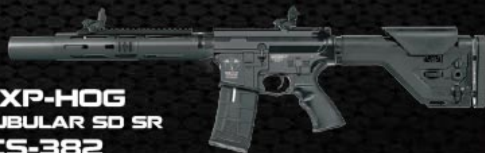
CXP-HOG TUBULAR SD SR ICS-382