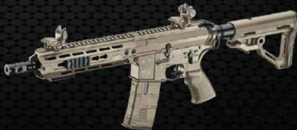
IMT-270-1 (Front Wired)