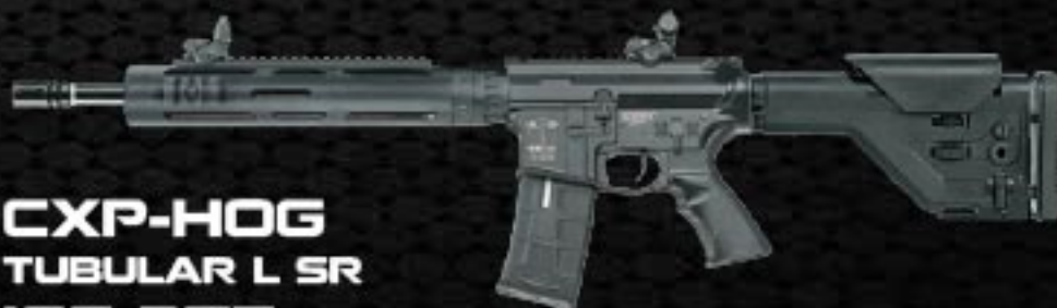
CXP-HOG TUBULAR L SR ICS-275