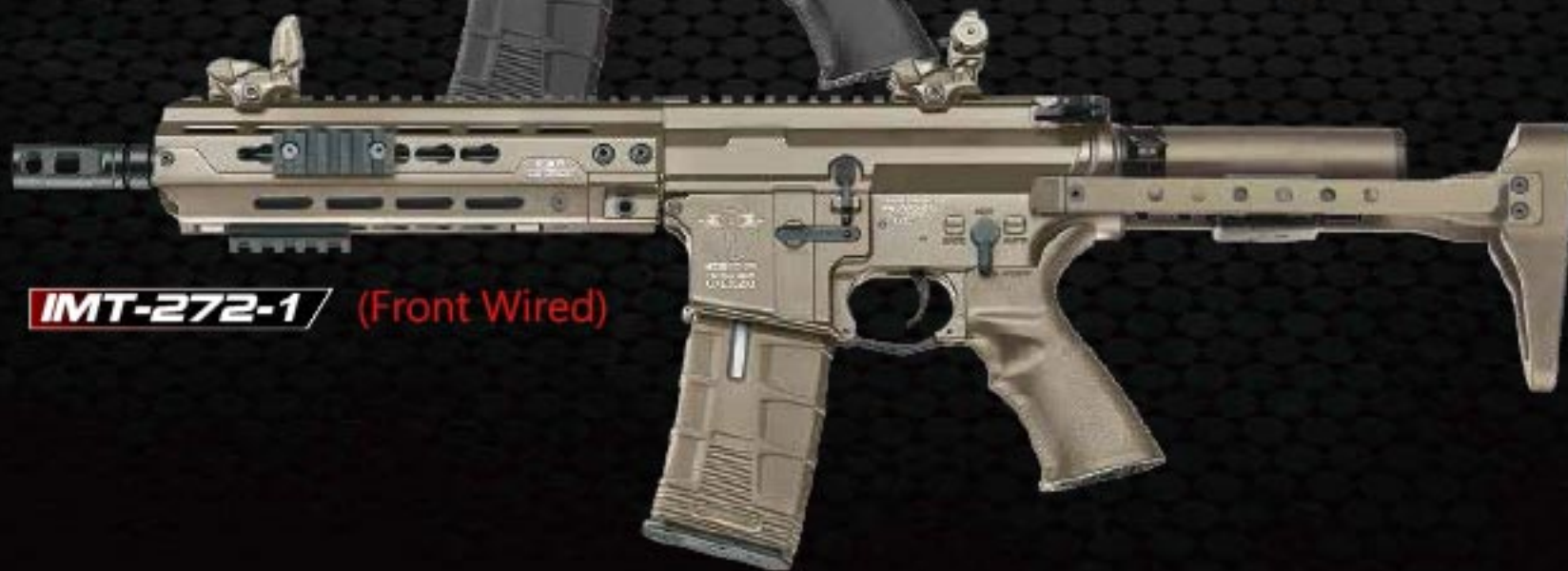
IMT-272-1 (Front Wired)