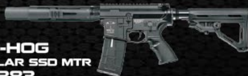
CXP-HOG TUBULAR SSD MTR ICS-383