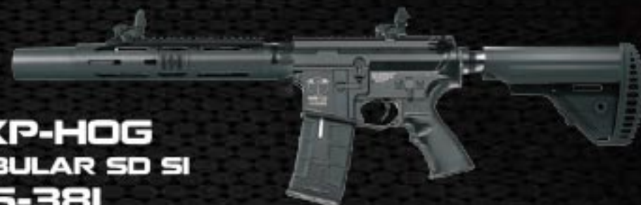
CXP-HOG TUBULAR SD SI ICS-381