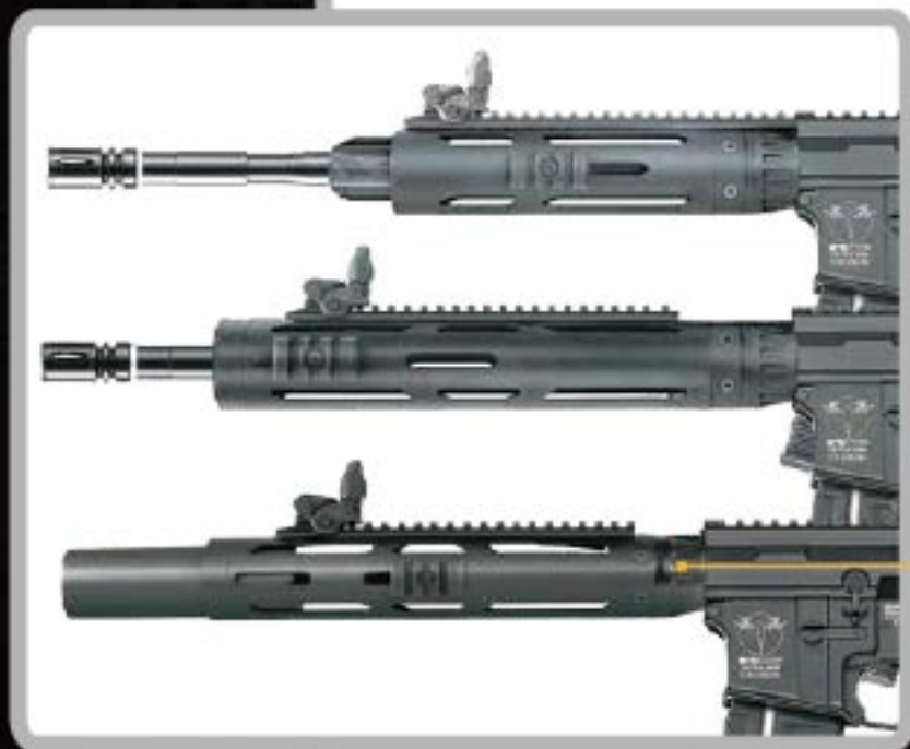
Free Float Tubular Handguard