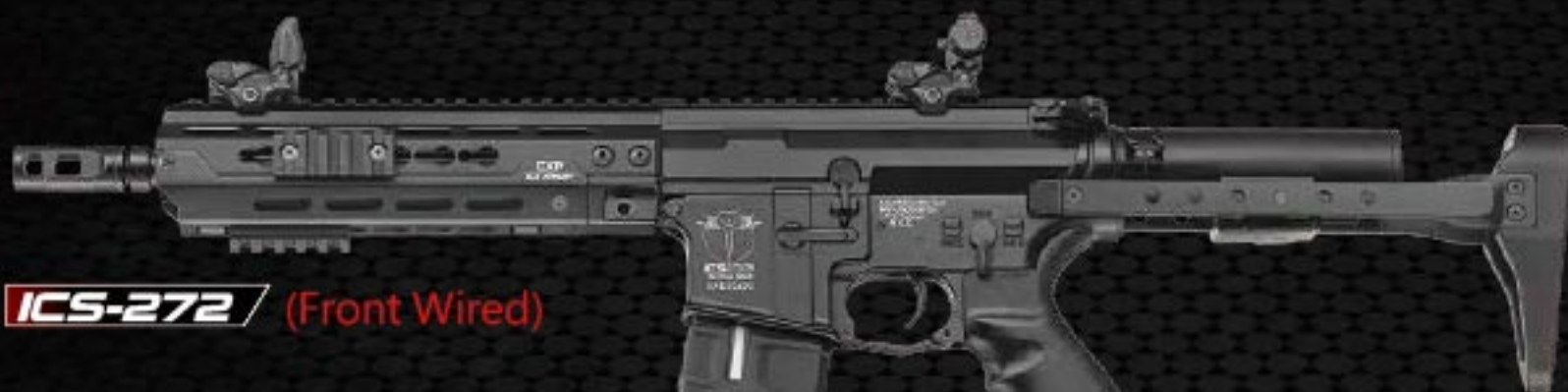
ICS-272 (Front Wired)

CXP-HOG, the newly short barrel designed look with modern style. "Hog" is a symbol of strong explosion.