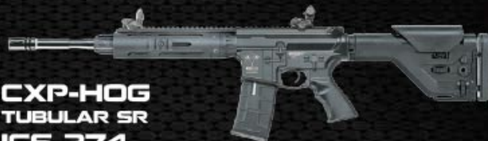
CXP-HOG TUBULAR SR ICS-274