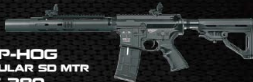
CXP-HOG TUBULAR SD MTR ICS-380