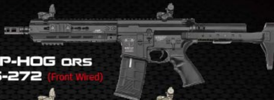
CXP-HOG ORS ICS-272 (Front Wired)