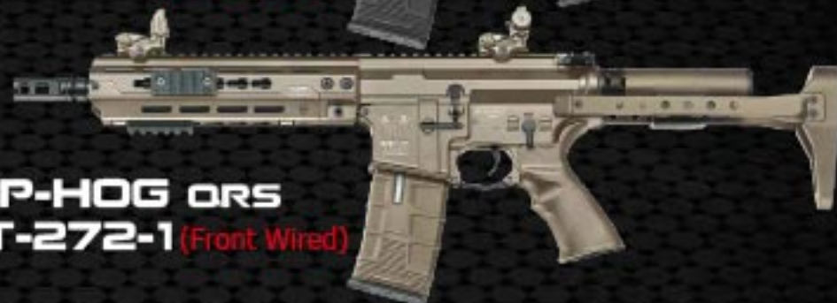
CXP-HOG ORS IMT-272-1 (Front Wired)