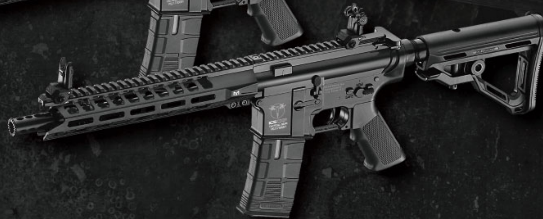
▶ ICS-441 CXP-Peleador C Sportline