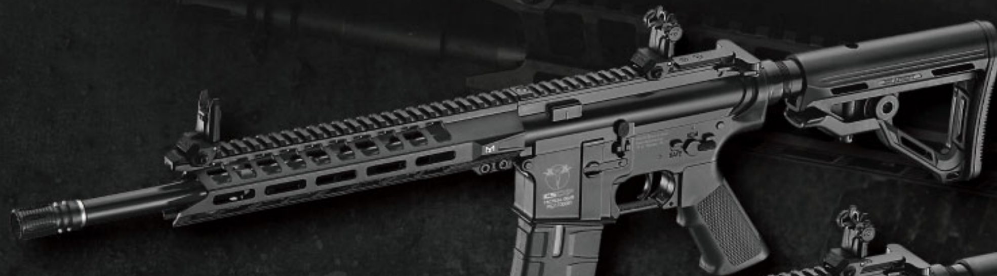
▶ ICS-440 CXP-Peleador Sportline